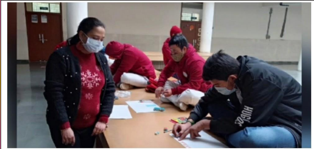
Students performing painting activity on Carnival Day