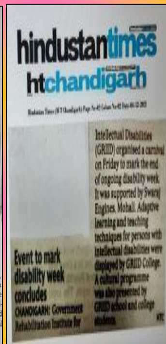
News of celebrations appeared in various newspapers