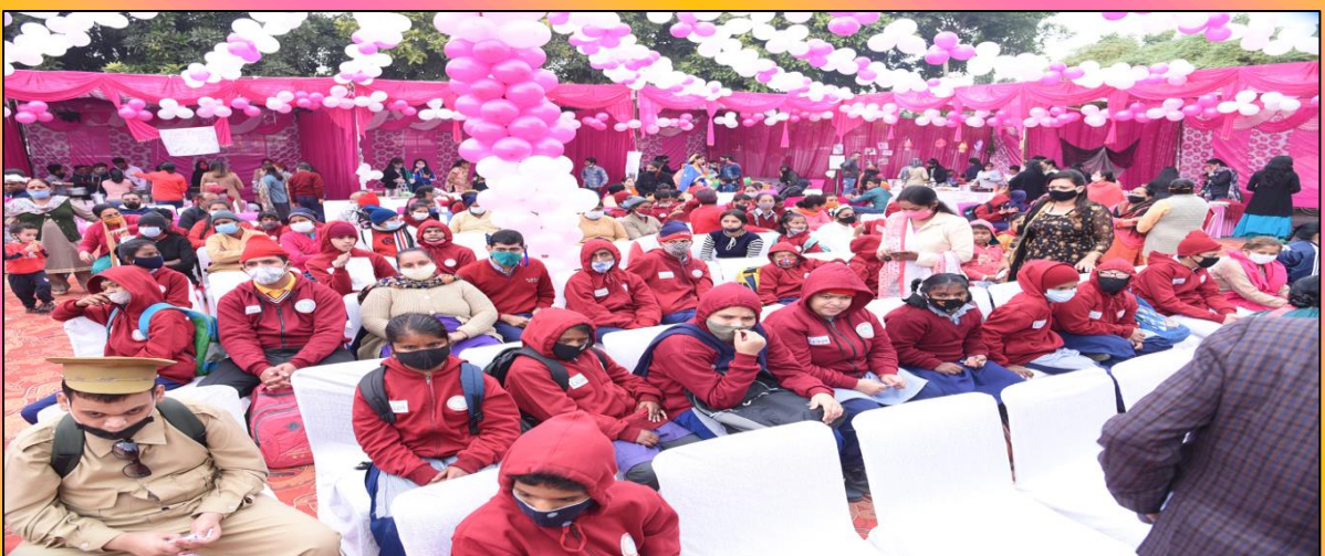
Students Sitting in courtyard on Carnival Day.