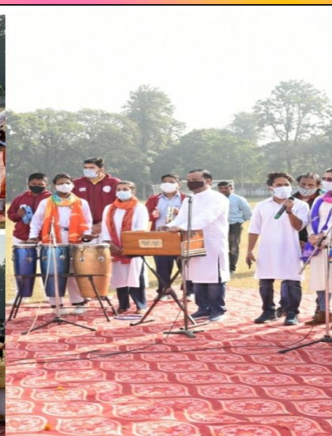
GRIID School Students performing Bhangra in Inauaural function