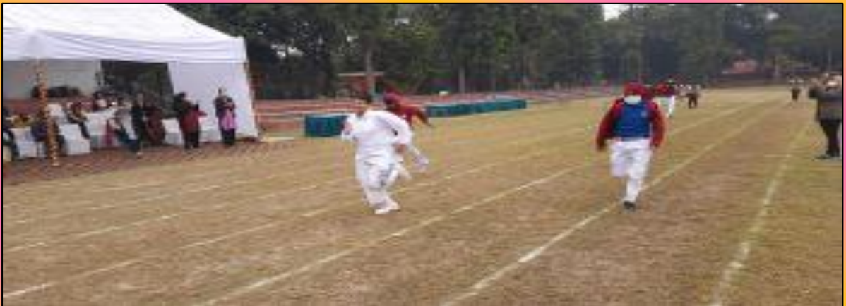
Students Performing During Athletic Events