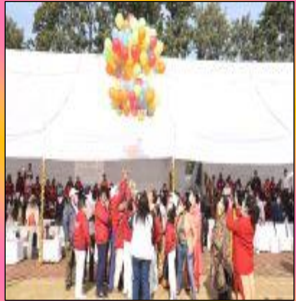
Release of balloons by the Chief Guest