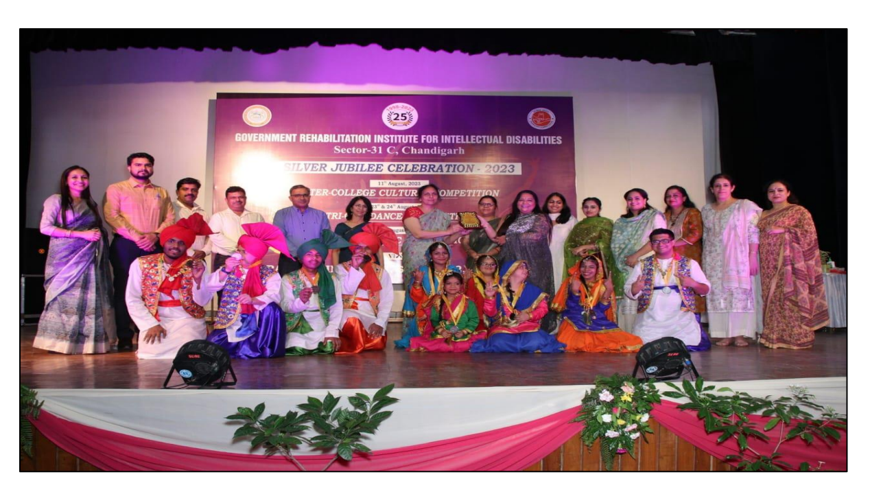
The Chief Guest gave prizes to the winners