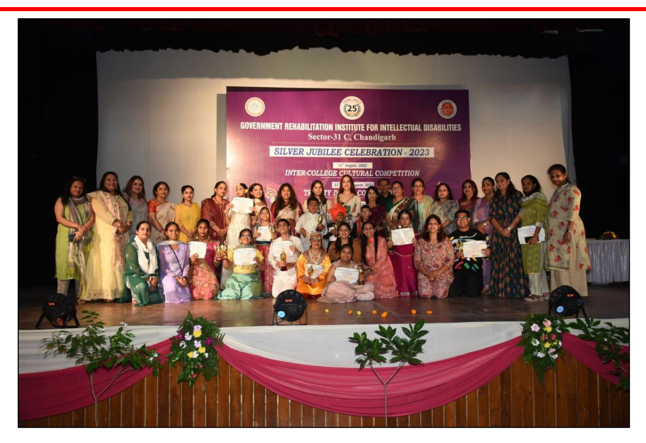
Group photo with the winners