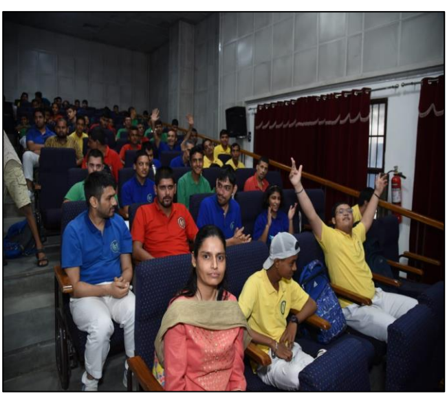
GRIID students and staff viewing competition