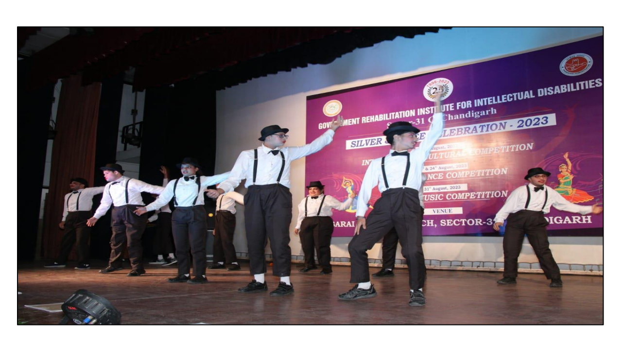
Participants giving group dance performance