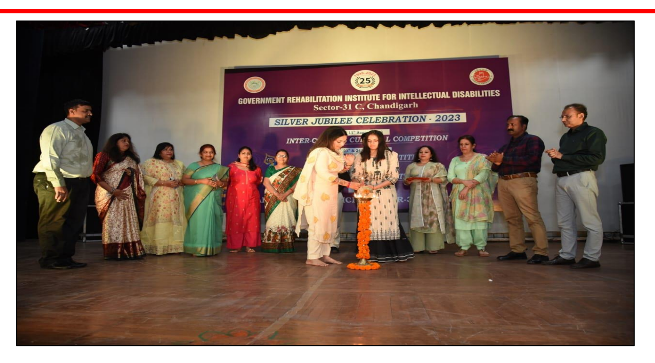
Dignitaries of the program lighting the lamp