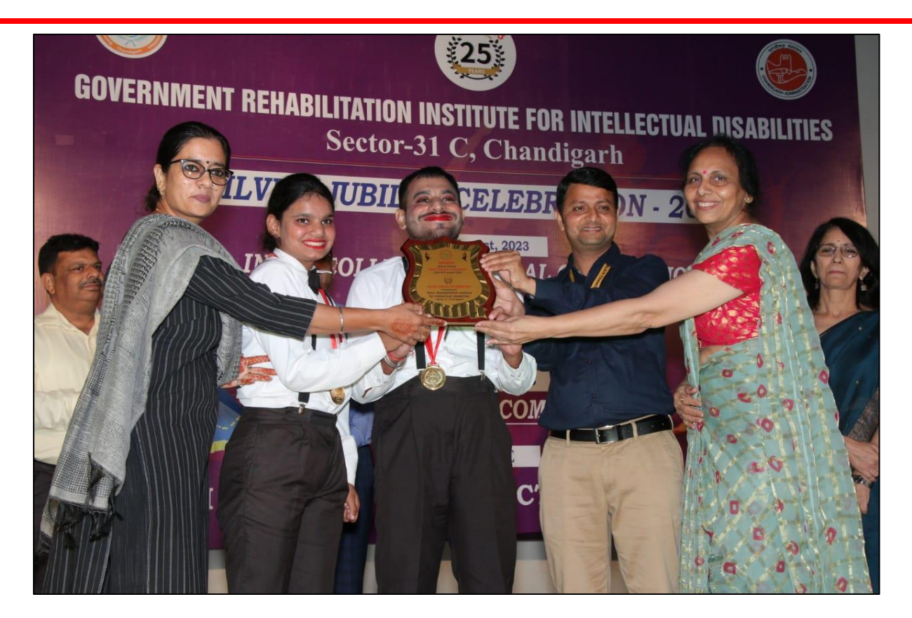
The Chief Guest gave prizes to the winners