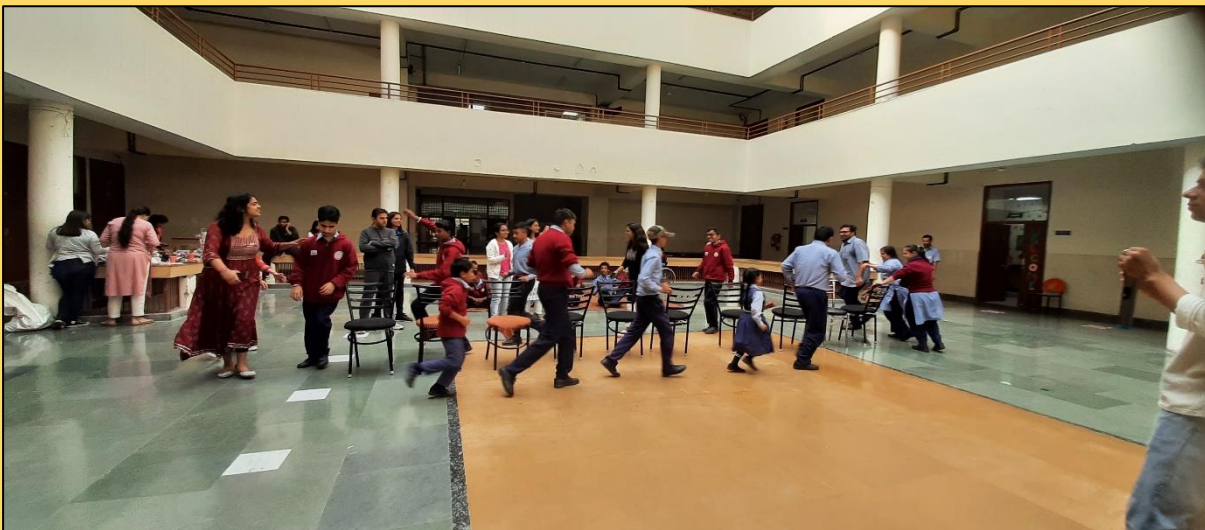
Students above doing diya painting activity and playing musical chairs