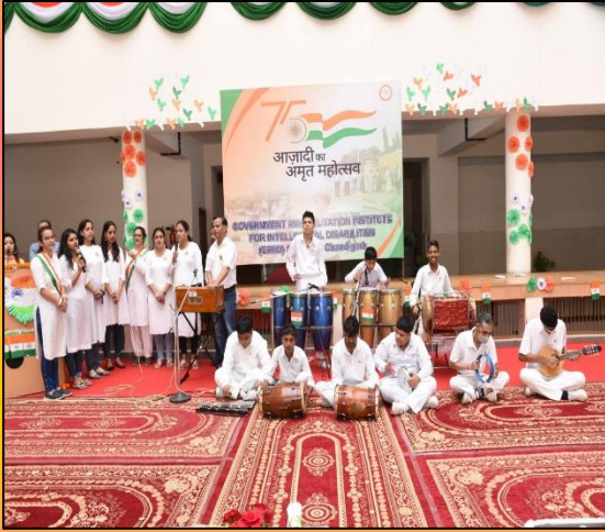
GRIID students and staff in group song