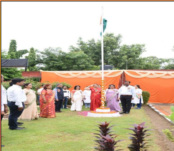
Flag Hoisting by Director GRIID, Joint Director GRIID, Principal GRIID and other officers