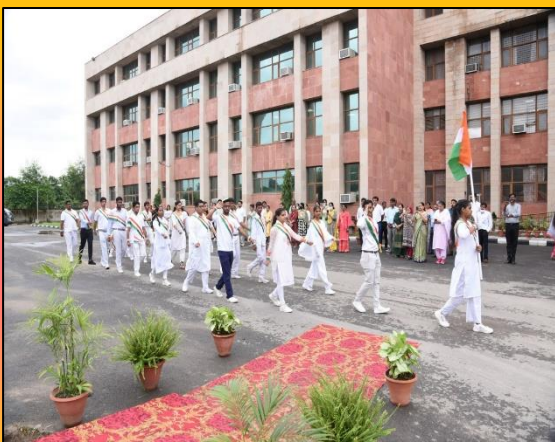
March past by students of GRIID school and college