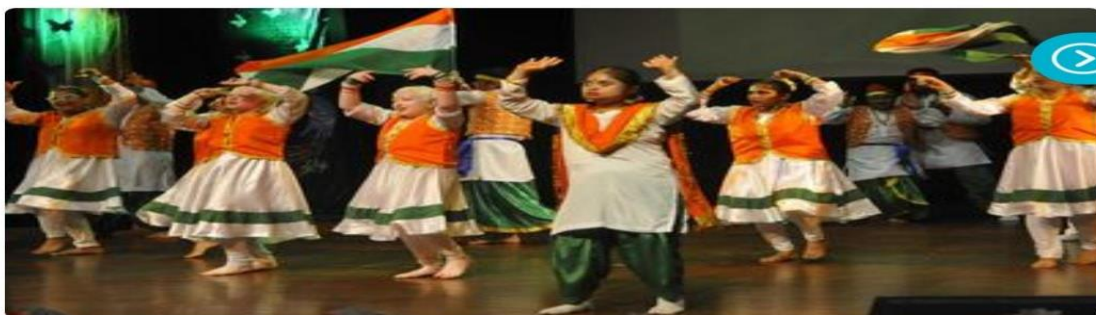
A cultural bonanza was organised Tagore Theatre, the eve of Independence Day.

The adviser lauded the commendable efforts of the students and congratulated them for celebrating 'Azadi Ka Amrit Mahotsav' to mark 75 year of India's Independence.