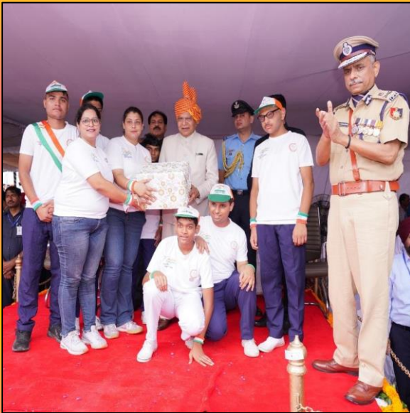
UT Administrator Sh. Banwari Lal Purohit giving away prizes to the GRID teachers and participants of GRID