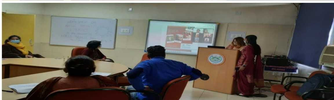
Teachers and students in online exhibition being organised from conference room