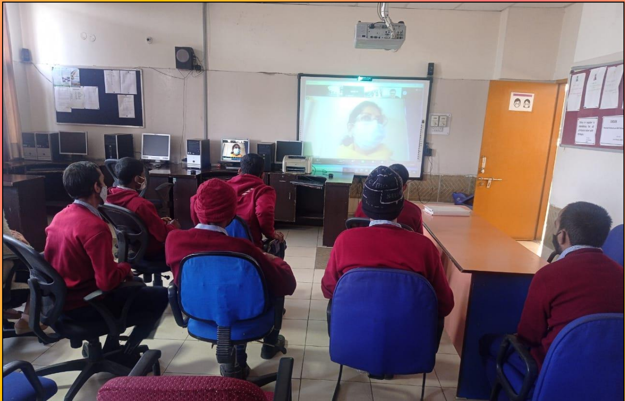
Students viewing online exhibition in IT room