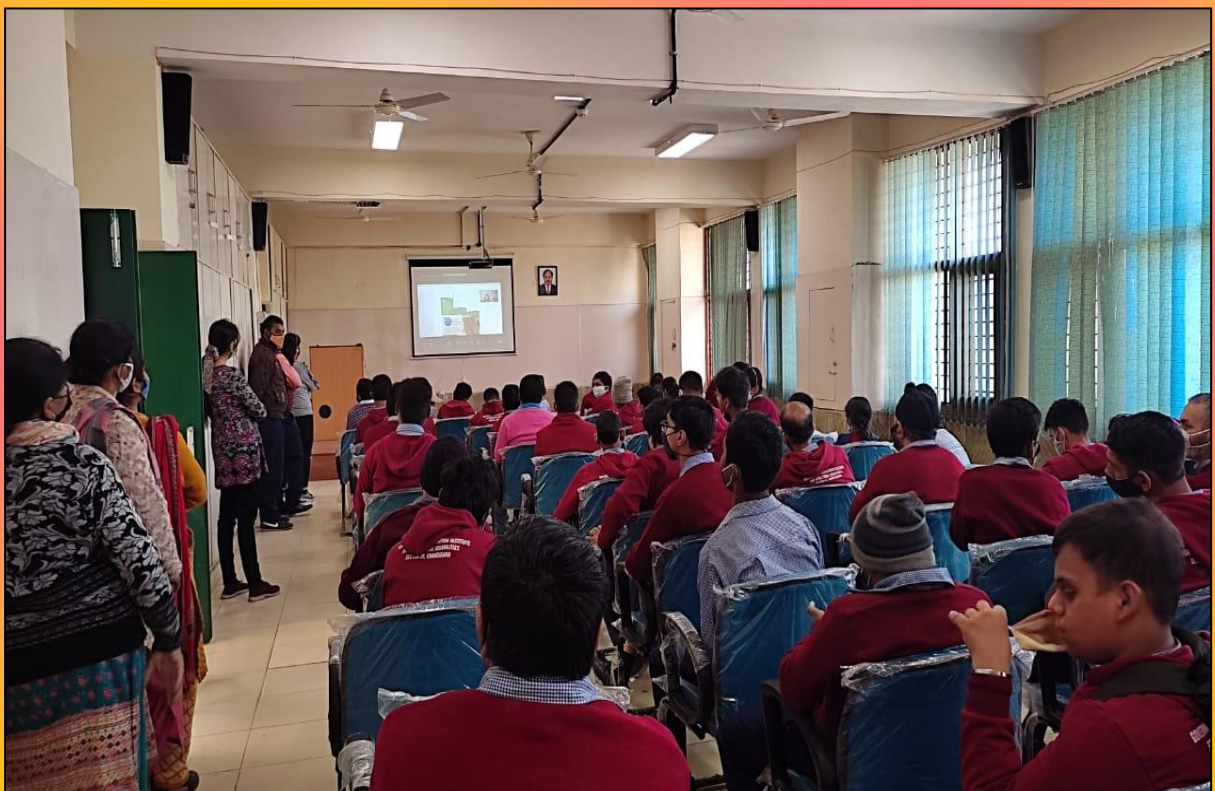
Teachers and students viewing online exhibition in auditorium