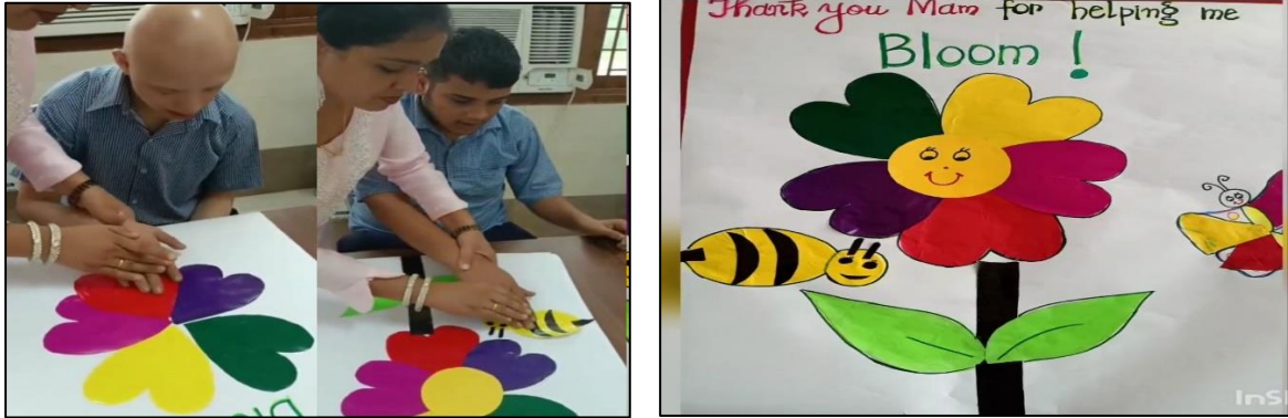
Students being taught to make flowers by pasting colourful papers.